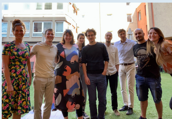
TRANSNATIONAL PARTNER MEETING SOFIA, BULGARIA (MAY 2022)

Next February there will be a training course in Palermo, aimed at youth workers and trainers with the purpose of addressing the problem of climate change using non-formal education practices. Stay tuned!